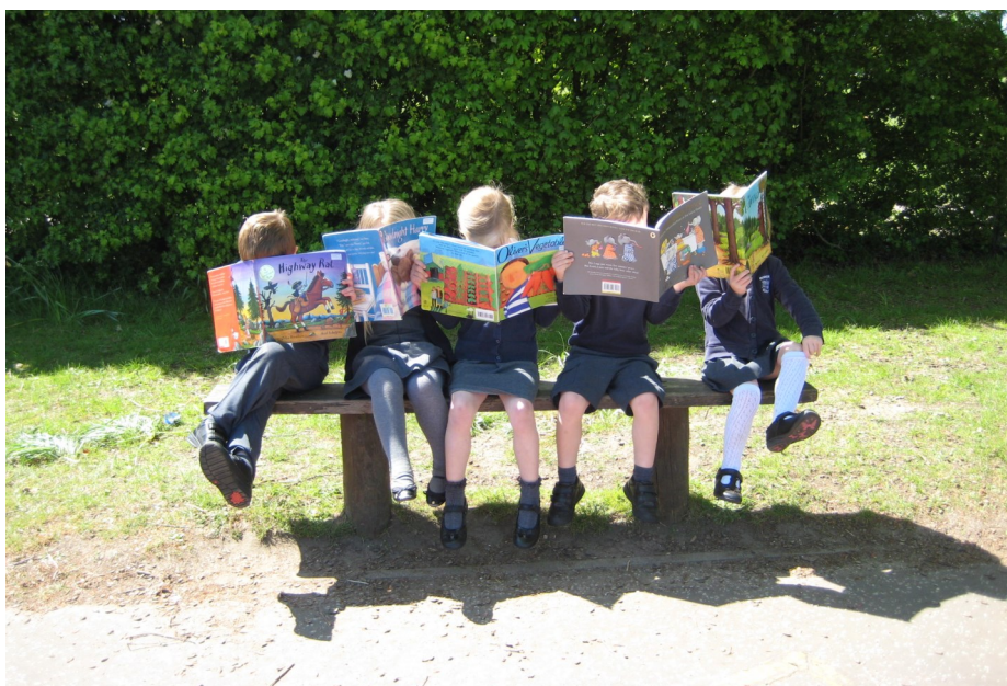
Encouraging a love of reading