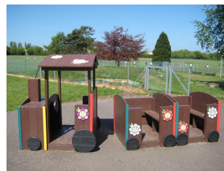
The school is well resourced

The arts, music and sports remain extremely popular; we hold Arts Weeks and Innovation Weeks to support the Arts.