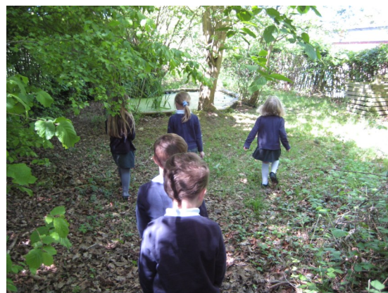
Exploring our wildlife area

in the 2019 parent survey, 100% of parents who responded, said that good behaviour is promoted by the school and that the school plans a broad, balanced and challenging curriculum.