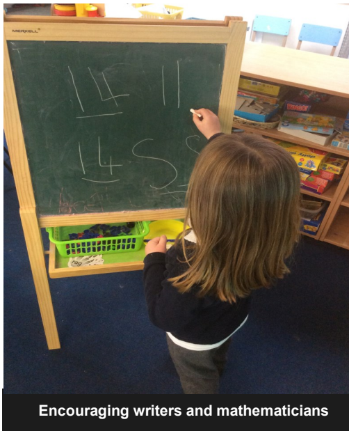
Encouraging writers and mathematicians

"I like the fact that Nursery children are included in school activities such as school plays and sports days".