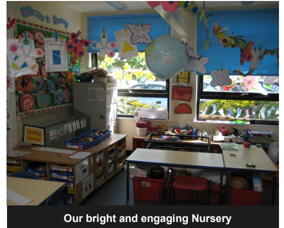
Our bright and engaging Nursery

In order to make learning exciting and stimulating, we have developed a challenging, creative curriculum that makes links between subjects and encourages cross-curricular learning. We base all of our work for each half term around a core story, which acts as a stimulus and inspiration for all of our work.