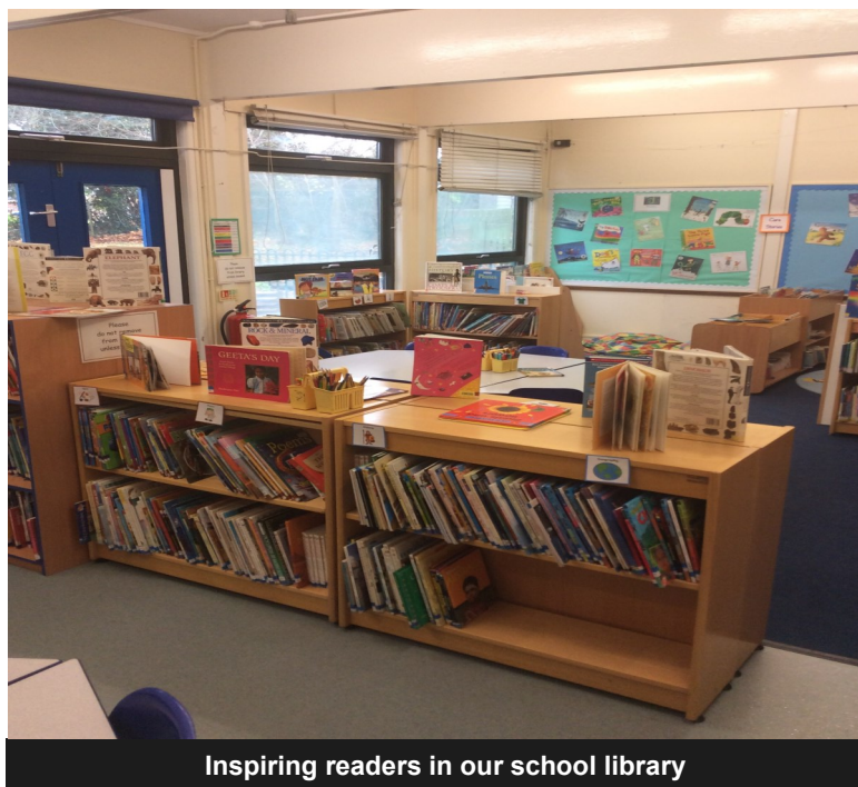
Inspiring readers in our school library

We welcome parents to contact us on 01508 530356 should you require further clarification.