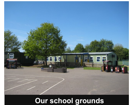
Our school grounds

In the 2019 parent surveys, 100% of parents who responded: said that their child enjoyed being at school, is making progress and the school is attractive and welcoming.