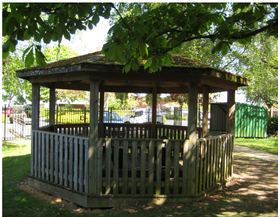
Our school has beautiful grounds and we encourage outdoor learning

It is our belief that all pupils of this school have a right of access to opportunities regardless of ability, age, gender, physical ability, capability or characteristics, racial or ethnic group, religious beliefs and social background. We also believe that all pupils should be encouraged to understand the implications of equal opportunity and regard and should be challenged to dispel the ignorance and distrust which breeds prejudice and discrimination.